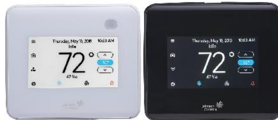
Figure 6: TEC3000 Color Series Thermostat

The TEC3000 Color Series Thermostats provide on/off, floating, and proportional control of: