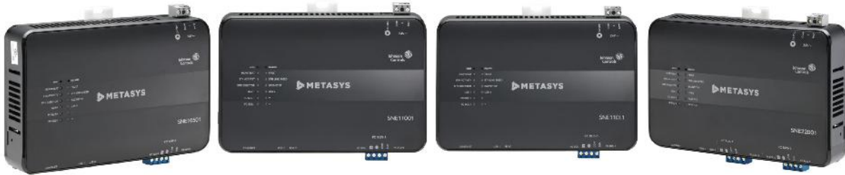
Figure 7: SNE series network engines

The following table outlines the SNE models in more detail. The letter G in a model's product code indicates that the model is the Buy American version.