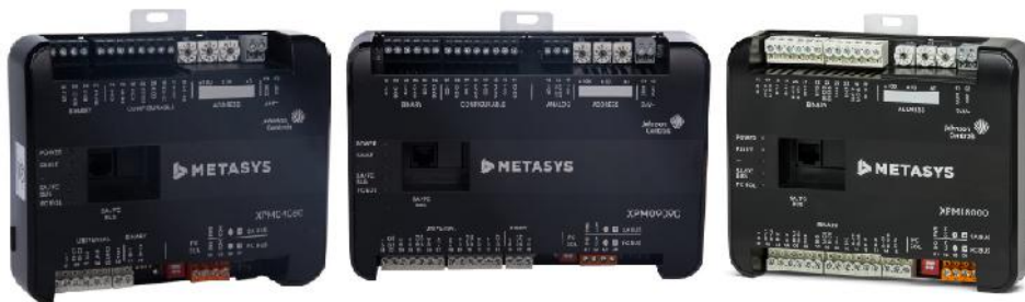
Table 3: Expansion I/O modules