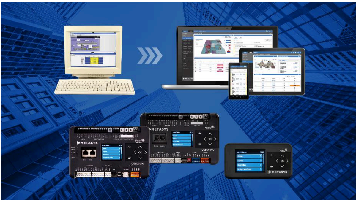
Figure 1: Metasys Release 13.0

Johnson Controls® is pleased to announce a new release of the Metasys system. Its substantial enhancements are designed to deliver better space utilization and planning, maximize operator efficiency, and enhance overall system performance and reliability.