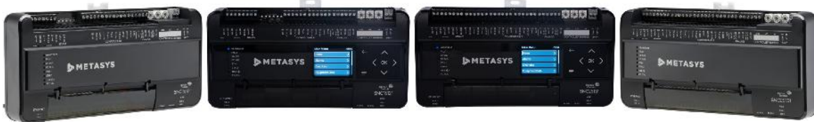
Figure 8: SNC series network control engines

The following table outlines the SNC models in more detail. The letter G in a model's product code indicates that the model is the Buy American version.