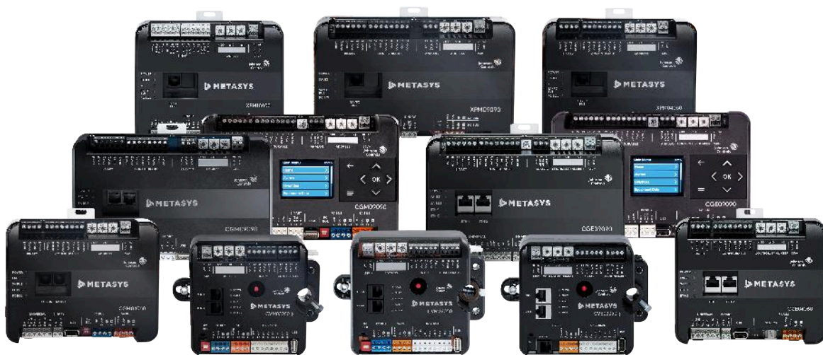
Figure 3: CG series and CV series equipment controllers and XPM expansion modules

The following tables outline the CG series and CV series controllers in more detail. The letter H in a model's product code number indicates that the controller model has an onboard display.