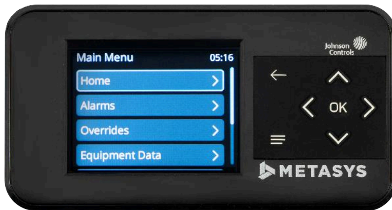
Figure 4: Remote mountable display